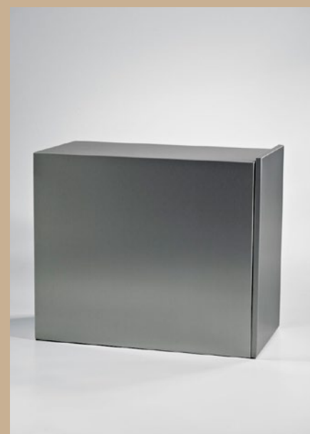
An elegant and refined product with a linear design