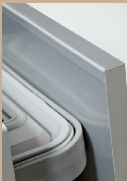
Front door boxed