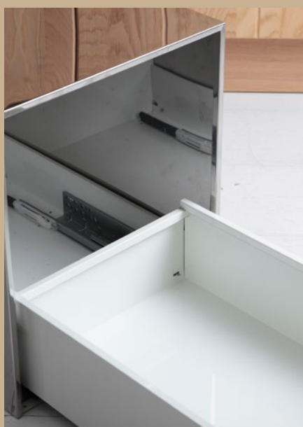
Robust internal structure in white galvanized steel sheet