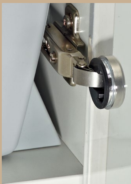
Space saving shaped sides