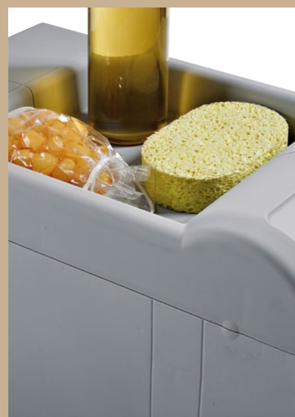
Upper tray to hold objects