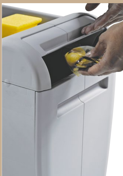
A hatch that flips open for the disposal of small waste